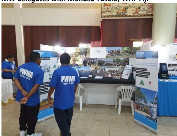
Moerk Water booth with the wonderful PPUC volunteers